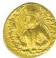
Lot # 7241

Please visit www.maruauction.com for online bidding