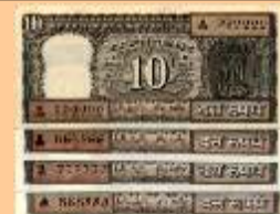
Lot # 344

10 Rupees , Sign by R N Malhotra , Inset B, Peacock series, 2 consecutive Fancy Serial numbers : Prefix 55D, 999999 & 1000000 . Both the notes are the last 2 notes in the Prefix range (Jhun & Rajgor# D37). Both are UNC, Rare. 2 notes