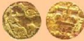
Lot # 30

Kadambas of Goa , 12th century AD, Gold, 4.35 g, Pagoda , a lion seated to left with right leg upraised towards a pillar on obv; a traditional temple on rev. Anonymous and undated.