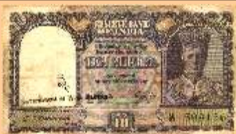
Lot # 317

Unique Note of West Pakistan, 10 Rupees , Sign by C D Deshmukh, 2nd Issue (Jhun type# 6.1). The note is Pre-Overprint series with the black Rubber Stamp impression on the watermark panel reading " Government of West Pakistan " and with a signature of an official just above. About Very Fine, Unpublished, probably Unique.