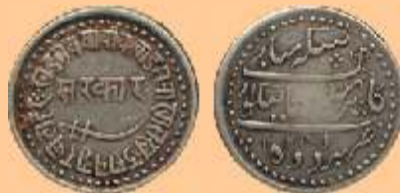
Lot # 98

Khande Rao , Silver, Nazarana Rupee , 10.79, Baroda Mint, name of the ruler Kahnde mis-spelt on rev., AH 1287 (KM# 4.1). Usual flat surface in centre on rev, otherwise, Extremely Fine, Very Rare.