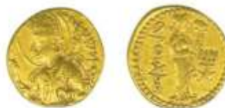
Starting Bid : Rs. 80,000