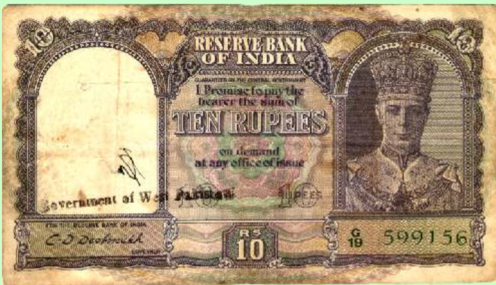
(Rajgor Auction No. 1, Lot # 317, 12-12-12, @ Pune)

The British Government followed up with the Indian Independence Act 1947, passed by the British Parliament on July 16, 1947, declaring August 15, 1947 as the date for the transfer of power and constitutional authority to India and Pakistan as two independent nations. The Independence Act which had embodied the terms of settlement and the modalities of its implementation recognized the almost insuperable difficulties of the transaction period.