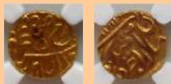
Lot # 136

Umaid Singh , Gold, 11.04 g, Mohur , with the name of George V , Jodhpur mint, Aum in Nagari on obv (KM# 129). Graded and slabbed by NGS as AU 58. With Certificate of Authenticity.