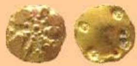
Lot # 32

Chalukyas of Kalyan , 10th century AD, Gold, 4.40 g, Pagoda , an ornate 8-rayed lotus (Padma) in centre on obv, uniface with minute countermarks on rev. Anonymous.