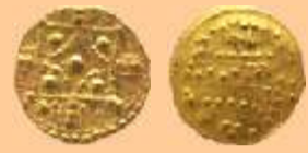
Lot # 31

Chalukyas of Kalyan , 10th century AD, Gold, 4.38 g, Pagoda , a well-designed square form with pellets in each corners and minute orientations in each sides of the square on obv, a traditional temple formed by lines on dots on rev. Anonymous.