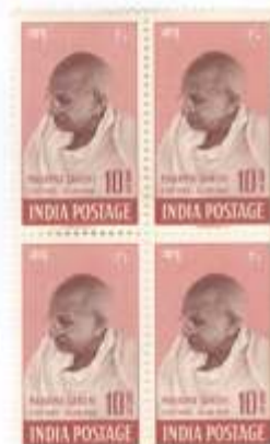
Starting Bid : Rs. 75,000