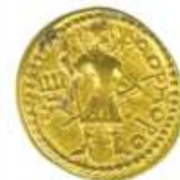
Starting Bid : Rs. 4,00,000