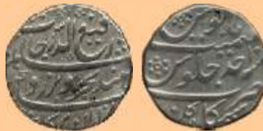
Lot # 138

Rafi ud Darjat, Silver, Rupee, Sikakul (Shrikakulam) mint, complete mint name at bottom on rev, RY Ahad (KM# 405.2). Extremely Fine+, Extremely Rare and has appeared for the first time in any Indian auction.