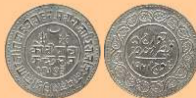
Lot # 234

Khengarji III, Silver, 14.07 g, 5 Koris, with the name of George V, VS 1973, AD 1921, Date Error, Milled edge and not inscribed edge (not listed by Shah). Extremely Fine+, Unpublished, Very Rare.