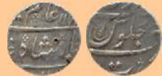
Lot # 189