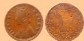
Lot # 387

Victoria Queen, Copper, 1/12 Anna, Calcutta mint, 1874, 17.40 mm, bust 'A', (Pridmore# 783), Fine + and date clearly visible, Extremely Rare