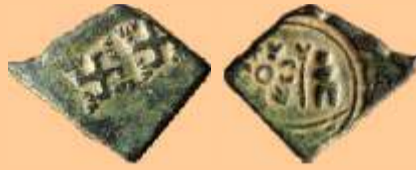
Lot # 1

Swastika Coin, Ancient Saurashtra (Gujarat), c. 50 BC, Copper, 7.05 g, anonymous, uninscribed, typical Ujjayini-type motifs depicting Lord Mahakaal (the deadly Form of Lord Shiva as a God of Death) holding a staff (Danda) and a water-pot (Kamandalu),