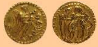
Lot # 34

Kushano-Bengal of Mainamati (5th century AD), Gold, 6.17 g, Dinar, Kushana style king standing to left holding bow and arrow on obv, Goddess Ardoxo standing to right holding a cornucopia and corrupt legend in right field on rev. About Extremely Fine, Rare.