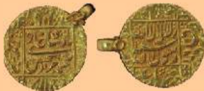
Lot # 62

Murad Baksh, Gold, 18.490 g, 1-½ Mohur Token, Surat mint, mint name in the left margin on rev, square-area type. Mounted for use as a pendant. Mint State, Unusual and First Known piece.