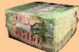
Lot # 384

5 Rupees, Complete Ream of 10 Packs (Bundles) of UNC Notes, Mahatma Gandhi Series with the Prefix of Fancy Numbers starting from 786001 to 786999 and the last note of 787000.