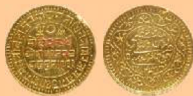
Lot # 166

Pragmalji II (AD 1860-1875), Gold, 9.39 g, 50 Koris or ½ Mohur, with the name of Victoria Queen, Bhujnagar mint, VS 1931, AD 1874, milled edge, die rotation at IX o'clock on rev. minor die-flow UNC with original luster, Extremely Rare.