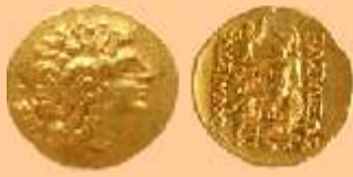
Lot # 03

Kingdom of Thrace, Lysimachus, Gold, 8.26 g, Stater. Diademed head of deified Alexander right, with horn of Ammon / BASILEWS LYSIMAXOY, Athena enthroned left, holding Nike on extended right hand & resting left elbow on shield propped against throne,