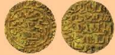
Lot # 40

Ibrahim Shah (AD 1402-1440), Gold, 11.42 g, Tanka, without Tughra style, Fi Zaman type on obv, Jaunpur mint (Rajgor# 2707; G&G# J2). Almost UNC and Extremely Rare in this grade.