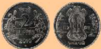
Lot # 307

2 Rupees Experimental Coin, Stainless Steel, 4.87 g, 2010, Hyderabad mint with Star as mint mark below the date on rev. In the centre of the coin on both the sides reads between two horizontal lines, EX PT for "Experimental".