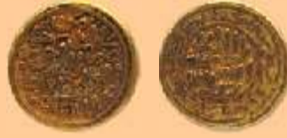
Lot # 34

Muhammad Tughlaq III, Gold, 12.91 g, Dinar, Hazrat Delhi mint, AH 727 in words. Kalima type on obv with the legend in margin reading epithet, mint and date; fi-zaman legend on rev (Rajgor# 1211; G&G# D334). Centrally struck with double circles on obv, Very Fine, Scarce.