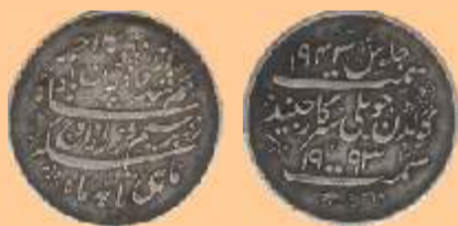
Lot # 157

Ranbir Singh (AD 1887-1947), Silver, 11.76 g, Nazarana Rupee, VS 1943 and 1993 (AD 1937), a special coin for the commemoration of the Golden Jubilee of his reign in AD 1937 (KM Y2). Extremely Fine with a small hallmark type punch on top rev, Extremely Rare.