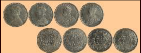
Lot # 218

Complete set of date wise, Silver, Rupee, (55), 1835 to 1945, except 1939 coin, Almost Very Fine to AUNC. Star dates 1881 (B) & 1897 (C), Extremely Fine, 1921 & 1922 AUNC, (55 coins)