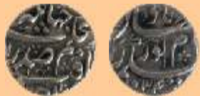
Lot # 54

Nur Jahan, Silver, ½ Rupee, Ahmadabad mint, AH 1034 (KM# 167.3). Deep striking, Extremely Fine+, Great Rarity.