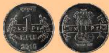
Lot # 308

1 Rupee Experimental Coin, Stainless Steel, 3.79 g, 2010, Bombay (Mumbai) mint with a Diamond Dot as mint mark below the date on rev. In the centre of the coin on both the sides reads between two horizontal lines, EX PT for "Experimental".