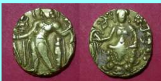
20. Chandragupta II Archer, 8.18 g, 17x18 mm