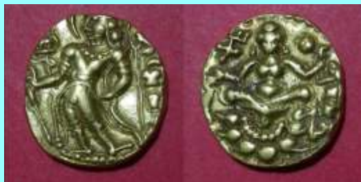
23. Kumaragupta Archer, 7.80 g, 18 mm