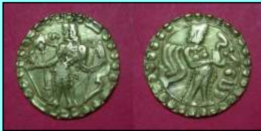
31. Samatata, Post-Gupta Bengal, 5.58 g, 21.5 mm. With Shrivasta on obv, rare