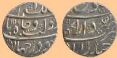
Lot # 40

Azam Shah (AD 1707), Silver, Rupee, Hyderabad Dar ul Jihad mint , Daulat wa Jah couplet, AH 1119, RY Ahad, complete mint name in the bottom line and mint epithet in the second line on reverse (KM# 332.8). Probably minted from the dies of Gold Mohurs.