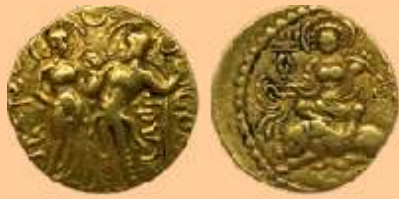
Lot # 9

The Great Gupta Empire, Samudragupta (AD 335-380), Gold, 7.54 gr, Dinar, King and Queen type , issued in memory of his parents, King Chandragupta I and the Lichhavi Queen Kumaradevi.