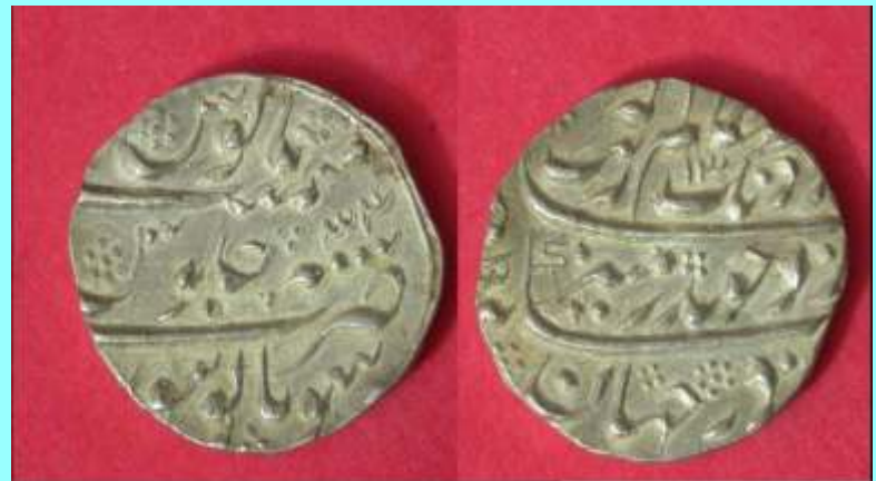
2. Silver Rupee, Aurangzeb mint Suba Purandar.