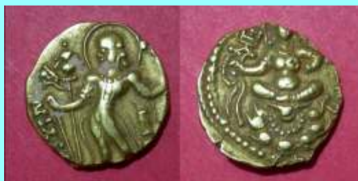
17. Kumaragupta Archer, 8.30 g, 17x18 mm