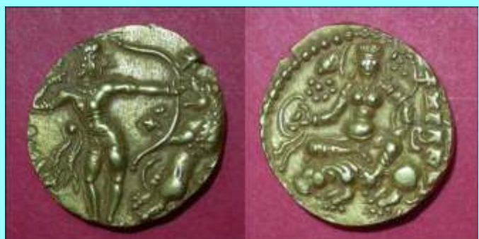
7. Skandagupta, lion slayer, 9.23 g, 21 mm Extraordinary rarity. Only 3 known