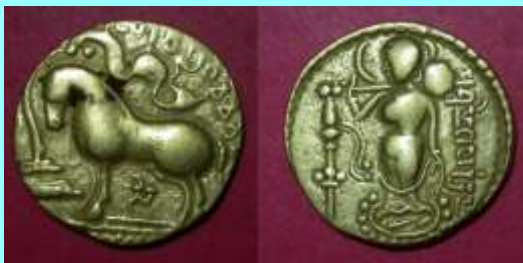
9. Samudragupta, Ashvamedha, 7.39 g, 20 mm