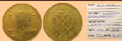
Lot # 142

CLASS: GOLD PROOF AUTHORITY: P. S. COMPANY DISCRIPTION: 2 REAS (GILT) PROOF DATE: 1791 WT: 3.19 EDGE: P. METAL: GILT