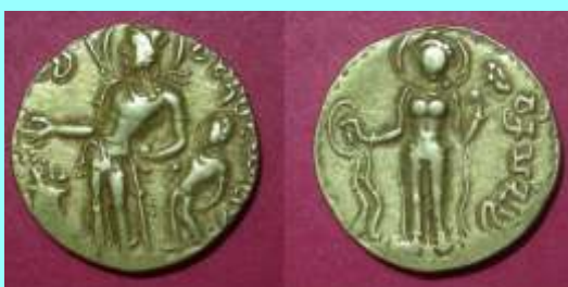
12. Chandragupta II, 7.95 g, 19 mm. Very rare variety of rev. Perhaps unique.