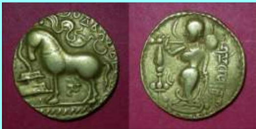
8. Samudragupta, Ashvamedha, 7.73 g, 21 mm