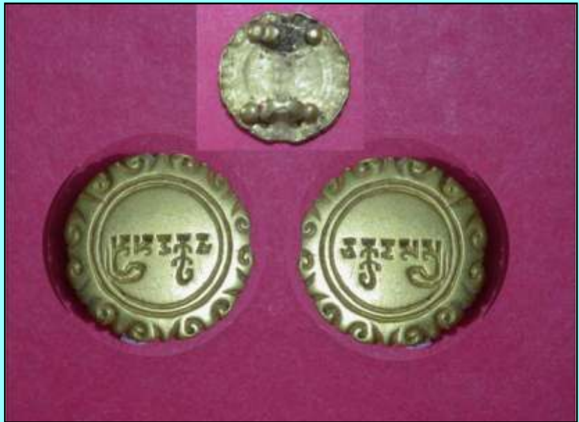
36. Chakradasasya seal 15 mm, 1.96 g. The servant of Chakka.