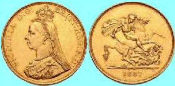
4. Victoria 5 Pounds