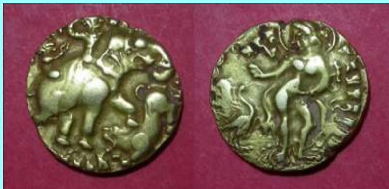
1. Kumaragupta, Elephant rider lion trampler, 8.04 g, 19 mm