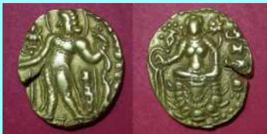
16. Chandragupta II Archer, 8.22 g, 18x20 mm