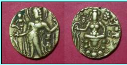
29. Chandragupta II Archer, 8.20 g, 18x19 mm