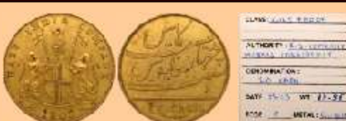
Lot # 153

CLASS: GOLD PROOF AUTHORITY: P. S. COMPANY DISCRIPTION: 1 PICE PROOF DATE: 1804 WT: 6.14 EDGE: P. METAL: GILT