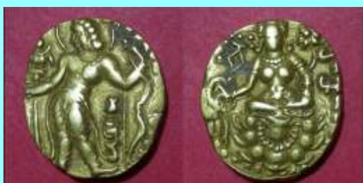
21. Chandragupta II Archer, 8.24 g, 17x20 mm