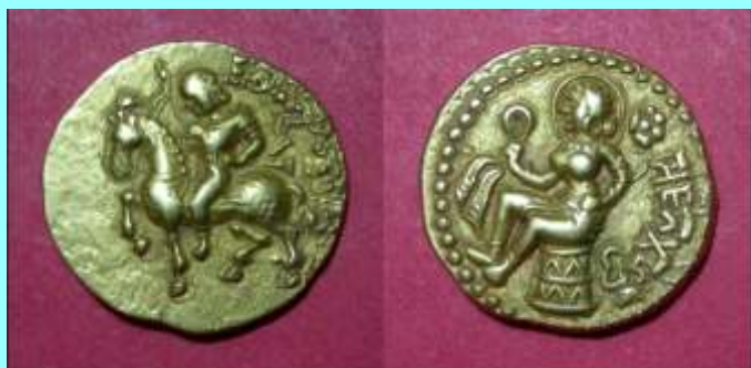
3. Kumaragupta, Horse rider, 8.39 g, 20 mm, completely different rev RRR