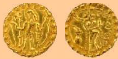
Lot # 12

Guptas of Samatata (Bengal), Jayagupta (7th century AD), Gold, 5.78 gr, Dinar, Lord Rama standing to left and holding bow in his left hand and an arrow in the right hand and looking at the arrow.