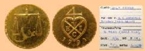
Lot # 141

CLASS: GOLD PROOF AUTHORITY: P. S. COMPANY DISCRIPTION: 4 REAS (GILT) PROOF DATE: 1791 WT: 6.78 EDGE: P. METAL: GILT