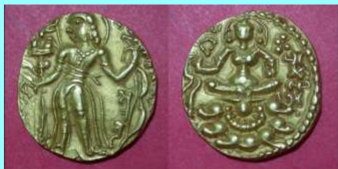
6. Skandagupta, Archer, 9.33 g, 21x22 mm