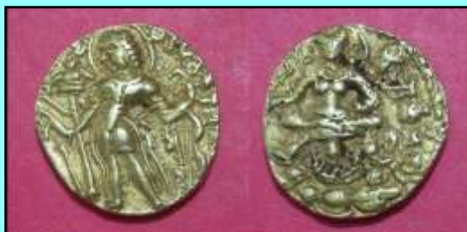
33. Skandagupta, Archer, 7.11 g, 20mm, Light weight standard, rare.