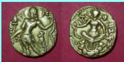
25. Chandragupta II Archer, 7.66 g, 18 mm