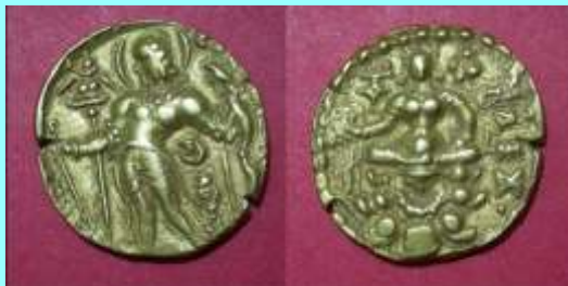
15. Chandragupta II Archer, 7.96 g, 20 mm