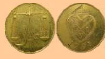
Lot # 138

Gold Gilt, 12.93 gr, 30.58 mm, Double Pice or 8 Reas Proof , Balemark on obverse with date 1791; Scales and Persian Adal (Justice) on reverse. Oblique milling, Inverted Axis, English mint (Pridmore# 120).