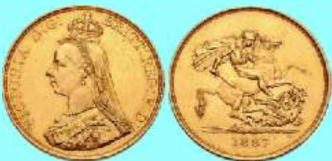
5. Victoria 2 Pounds