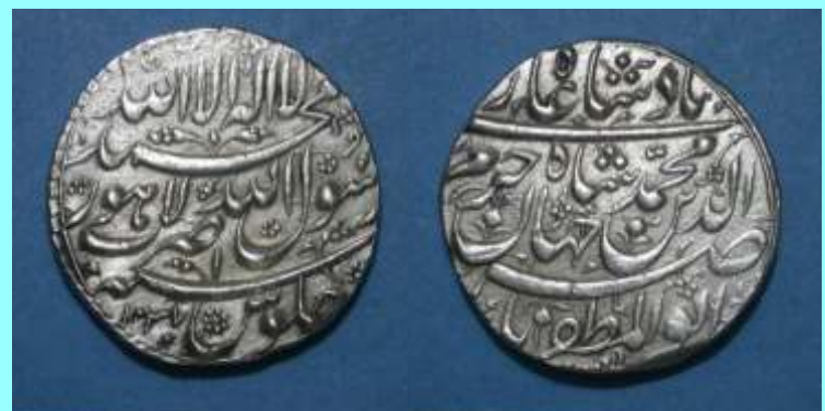
1. Silver Rupee, Shahjada Khurram Lahore 1037 AH.