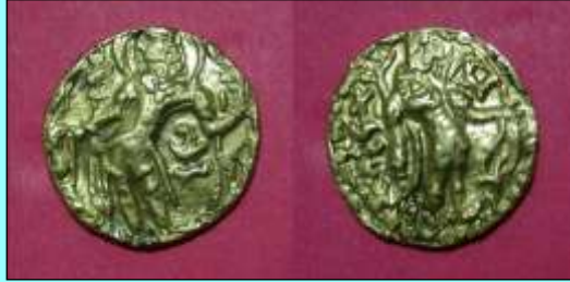
30. Jayagupta, Archer, 6.53 g, 18 mm