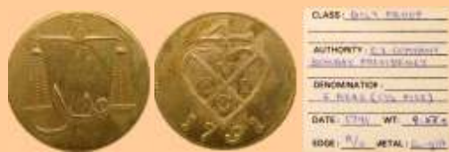
Lot # 139

CLASS: GOLD PROOF AUTHORITY: P. S. COMPANY DISCRIPTION: 8 REAS (GILT) PROOF DATE: 1791 WT: 12.93 EDGE: P. METAL: GILT