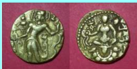
26. Chandragupta II Archer, 7.75 g, 18 mm