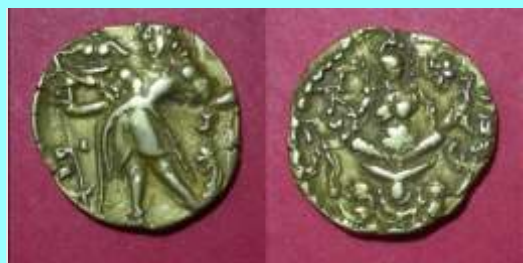
18. Chandragupta II Archer, 7.65 g, 19 mm