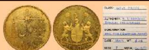
Lot # 143

CLASS: GOLD PROOF AUTHORITY: P. S. COMPANY DISCRIPTION: 8 REAS (GILT) PROOF DATE: 1794 WT: 13.00 EDGE: P. METAL: GILT