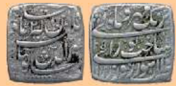
Lot # 27

Jahangir, Silver, 13.62 gr, Heavy, Jahangiri Rupee, Square, Lahore mint , Sakhat Nurani type, AH 1015, RY 2 (KM# 157.1). Very Fine+, Exceedingly Rare.