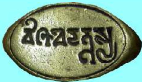
34. Vishakhadatta seal 13x22 mm, 8.48 g. old Seal, within oval border, Brahmi inscription engraved in reverse on basal: Vi akhadattasya.