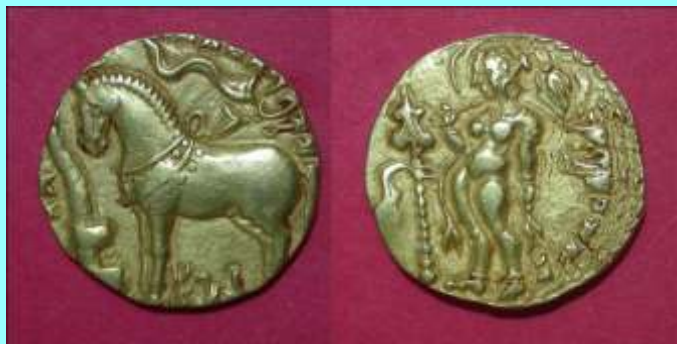
2. Kumaragupta, Ashvamedha, 8.10 g, 20 mm, Great rarity.