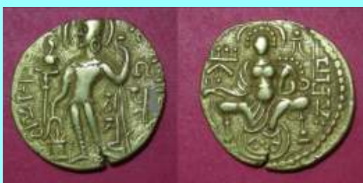
14. Samudragupta Archer, 7.48 g, 20mm