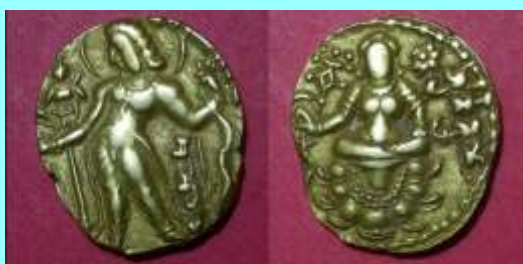
19. Chandragupta II Archer, 8.26 g, 18x20 mm