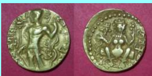
13. Chandragupta II Archer, 7.55 g, 19 mm. Rare