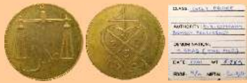
Lot # 140

CLASS: GOLD PROOF AUTHORITY: P. S. COMPANY DISCRIPTION: 6 REAS (GILT) PROOF DATE: 1791 WT: 9.56 EDGE: P. METAL: GILT