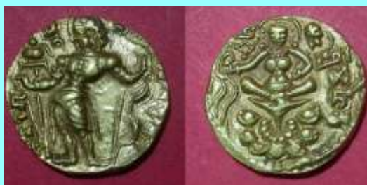
24. Kumaragupta Archer, 8.18 g, 19x20 mm. No ku or Kumara .