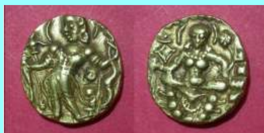
28. Chandragupta II Archer, 7.91 g, 16x17 mm