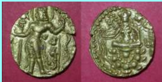
22. Chandragupta II Archer, 8.28 g, 21 mm