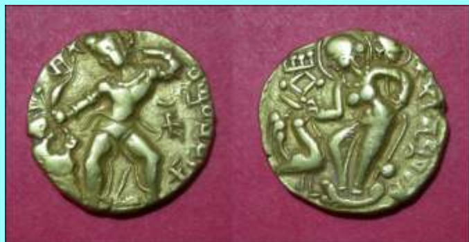
4. Kumaragupta, Tiger slayer, 8.12 g, 18 mm