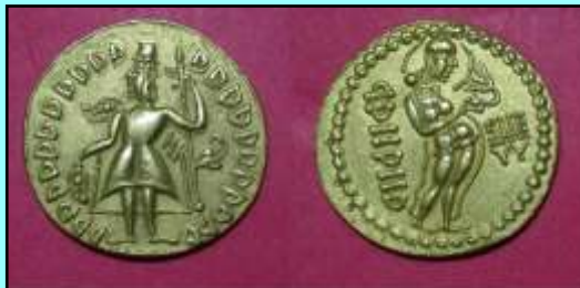
32. Samatata, Post-Gupta Bengal, 6.59 g, 21 mm. With double Tamgha on rev, rare