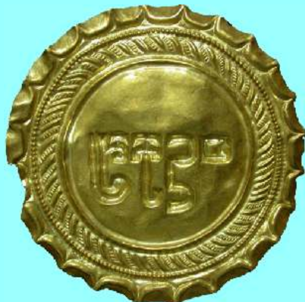
37. Battkasya seal, 50 mm, 6.75 g. A seal of a minister named Battaka.