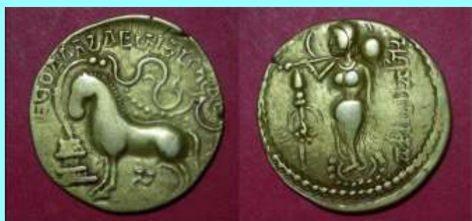
5. Samudragupta, Ashvamedha, 7.38 g, 22 mm. Full legends