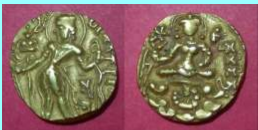
11. Skandagupta, Archer, 9.10 g, 20 mm