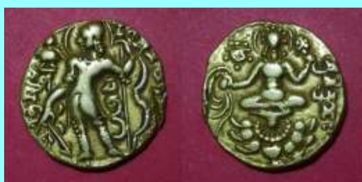
27. Chandragupta II Archer, 7.38 g, 19 mm