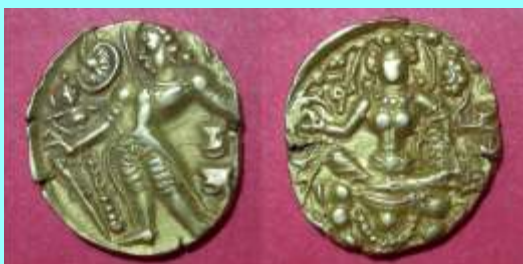
10. Chandragupta III, 8.49 g, 20x21 mm