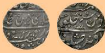
Lot # 122

Maharaja Hate Singh (AD 1765-1768), Orchhanagar mint , Silver, 11.17 g, 22.42 mm, Nazarana Rupee , in the name of Shah Alam II, with the mint name Roshan Akhtar Orchhanagar mint, RY 6, the couplet on the obverse reads in Persian, Sikka zad bar haft kishwar, sayah fazilah; hami-din Muhammad Shah alam badsha,