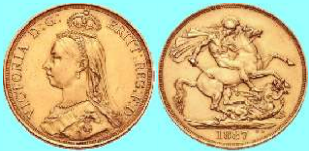
3. Victoria 5 Pounds