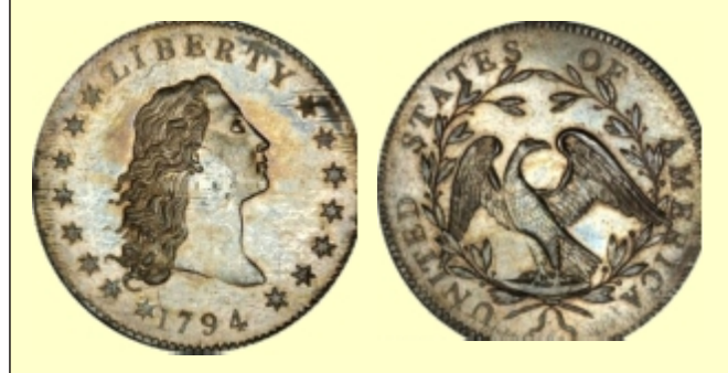
The 1794 Flowing Hair dollar coin. Obvesre: Head of Liberty surrounded by 15 stars representing the 15 states and "1794". Reverse: Eagle within a wreath and "UNITED STATES OF AMERICA"

Ever wondered, what could be the possible price of the most expensive coins in the world that has actually been sold and someone has indeed paid real money to the seller? Well, in terms of realised price that honour goes to the United States 1794 Flowing Hair dollar. In January 2013, US auction house Stack's Bowers sold a piece for USD 10.02 million including buyers premium. Yes, close to Rs 65 crores.