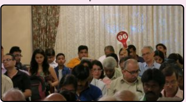
Active participation of the floor on lots of their choice in the auction