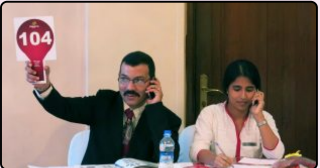
Phone Bidding Counter was abuzz with constant bidding against the floor for their important lots