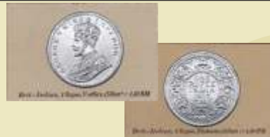
Lot 505 Estimate: ₹ 1,000-1,500 Realized Rs. 5250