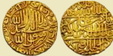
Lot 357 Estimate: ₹ 60,000-70,000 Realized Rs. 85,000