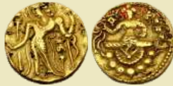
Lot 318 Estimate: ₹ 1,00,000-1,35,000 Realized Rs. 1,25,000