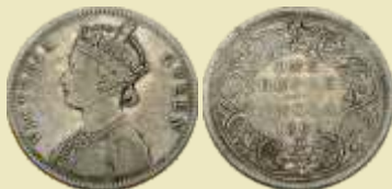
Lot 479 Estimate: ₹ 7,000-7,500 Realized Rs. 12,000