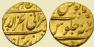
Lot 411 Estimate: ₹ 2,00,000-3,00,000 Realized Rs. 2,40,000