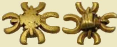
Lot 304 Estimate: ₹ 5,000-7,000 Realized Rs. 8,500