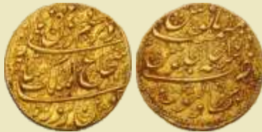
Lot 404 Estimate: ₹ 60,000-65,000 Realized Rs. 81,500