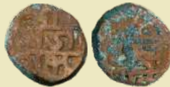
Lot 406 Estimate: ₹ 5,000-5,000 Realized Rs. 16,000