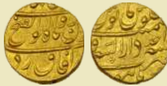
Lot 390 Estimate: ₹ 1,40,000-1,75,000 Realized Rs. 1,55,000