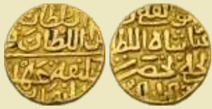
Lot 344 Estimate: ₹ 1,40,000-1,75,000 Realized Rs. 1,40,000