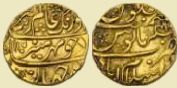
Lot 385 Estimate: ₹ 1,40,000-1,50,000 Realized Rs. 1,40,000