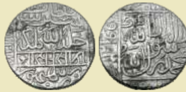
Lot 331 Estimate: ₹ 9,000-12,000 Realized Rs. 16,500