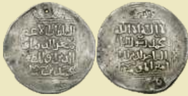
Lot 330 Estimate: ₹ 4,000-5,000 Realized Rs. 10,000