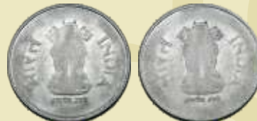
Lot 515 Estimate: ₹ 10,000-15,000 Realized Rs. 25,000