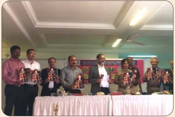
Rare Fair 2016