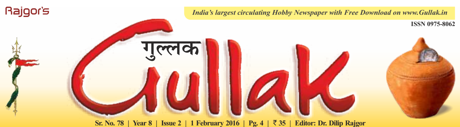
Your Complete Monthly Newspaper for Coins, Medals, Paper Money, Collectibles, Antiquities, Decorative Arts & Hobby